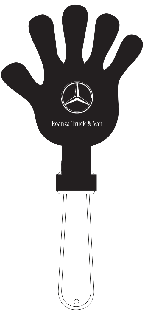
ARTWORK SCALE 50%